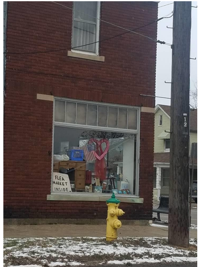
Thompson Street Facing Windows: 94 w X 60 H