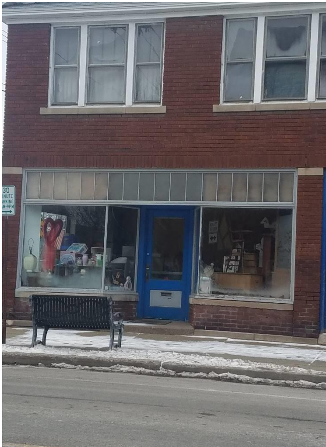
Oliver Street Facing Windows: 64 w X 60 H

The selected window for the 3D Installation is a corner building, with three large windows.